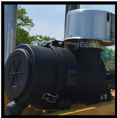
Engine Air PreCleaner