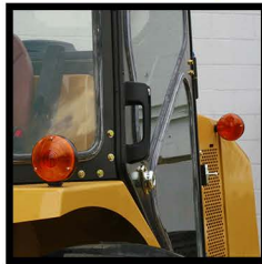
Turn Signal Package