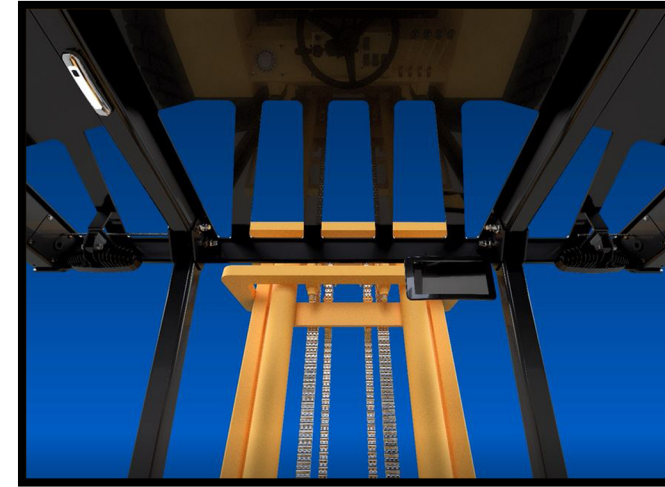
OVERHEAD VIEWING AREA