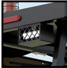
LED Light Guards