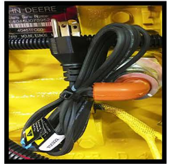
Engine Block Heater