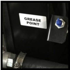
Steer Axle Grease Zert