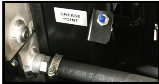
STEER AXLE GREASE ZERT