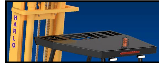
NEW & IMPROVED OVERHEAD GUARD