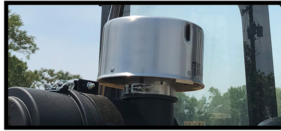
ENGINE AIR PRECLEANER